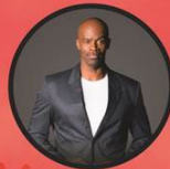
Michael Jr., Comedian

JOIN THOUSANDS OF CHRISTIAN COUPLES IN CHURCHES AROUND THE COUNTRY FOR A ONE-NIGHT LIVESTREAM EXPERIENCE.