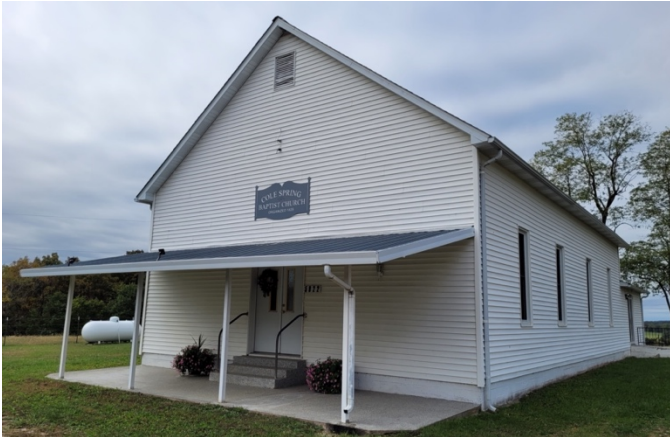
Located near Russellville at the junction of state Route V and Mount Olive Road, Cole Spring Baptist Church has a legacy dating back to 1835. It has not only ministered to several generations but helped establish four other Baptist churches in the area.