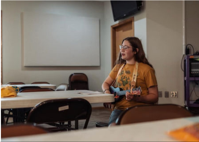
Playing worship music one evening at the Concord Builder's Trip.

I am so blessed to have had the opportunity to be the Summer Missionary for the Concord Baptist Association this year! I loved being a part of both events that I'd had experience with and those I'd never heard of before. It shows me just how much God is working all around me.