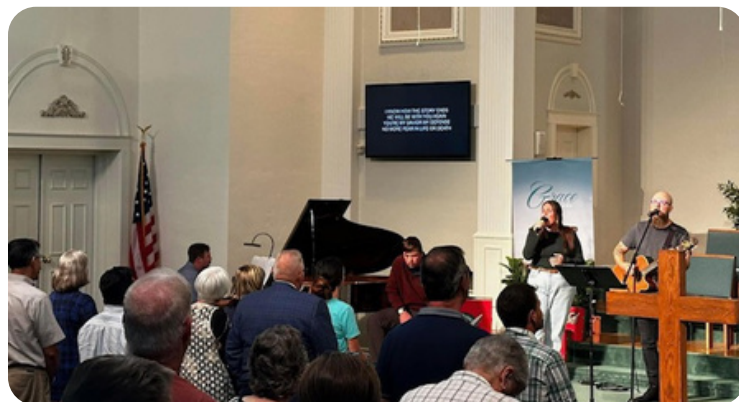
Pictured above: Freshwater Praise & Worship Team leading the worship service.