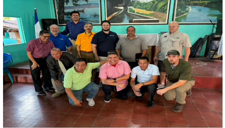
CBA Mission Team and Pastors from Cadalaria De La Frontera Region, El Salvador