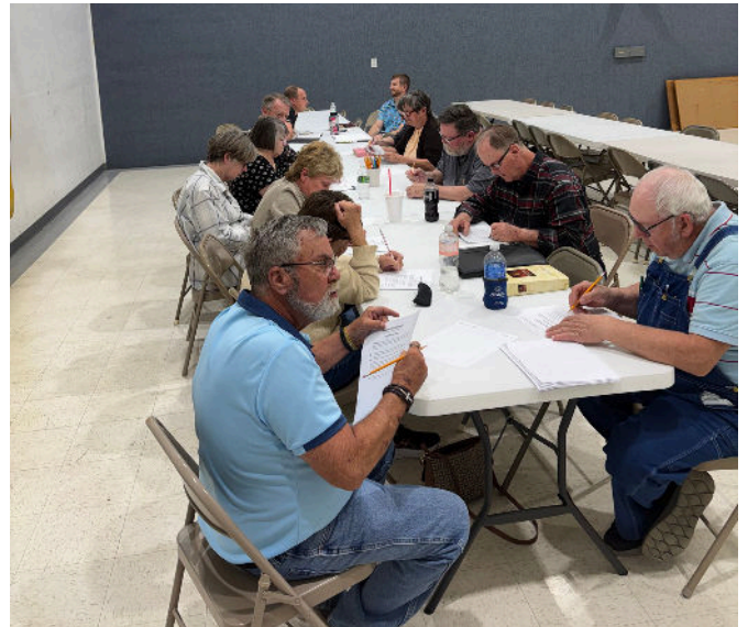
Clarksburg Baptist Church hard at work during the Discovery Phase of Resound on April 26, 2026.